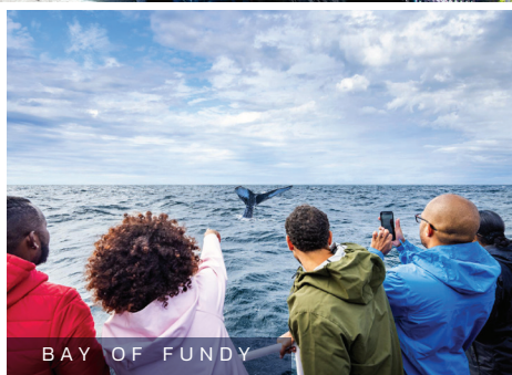
BAY OF FUNDY