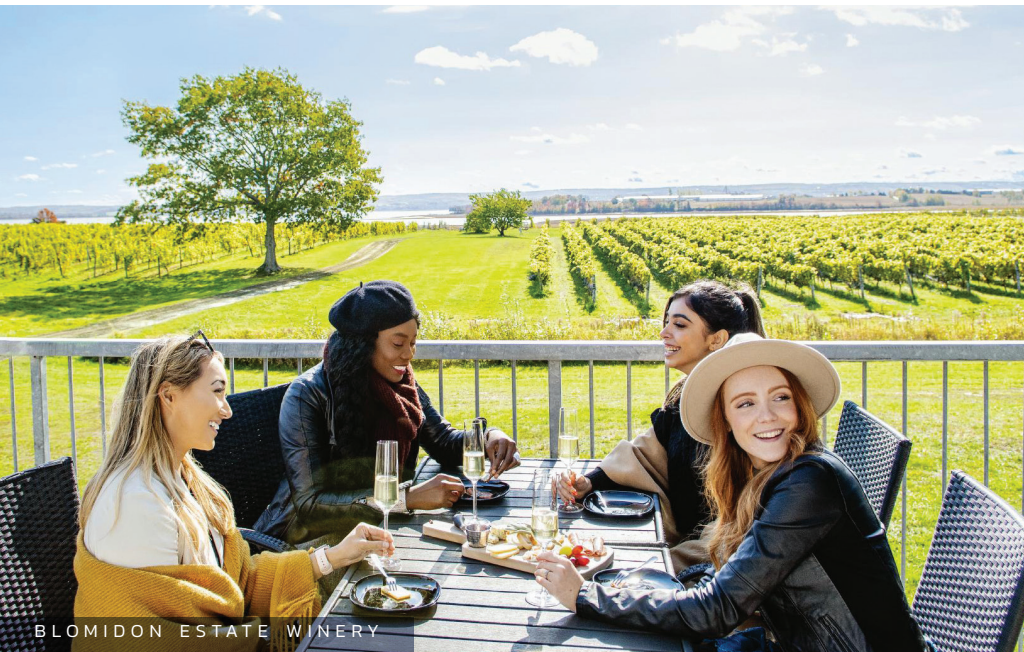
BLOMIDON ESTATE WINERY

Feel the rush of riding eight to 20+ foot waves in a white-water Zodiac boat as the surging power of the Bay of Fundy's world's highest tides turns the Shubenacadie River into a water roller coaster on the Shubenacadie River, just 30 minutes from Truro. Explore hiking trails leading to incredible vistas that overlook the Bay of Fundy, walk on the ocean floor, and watch for whales off Digby Neck and Islands.